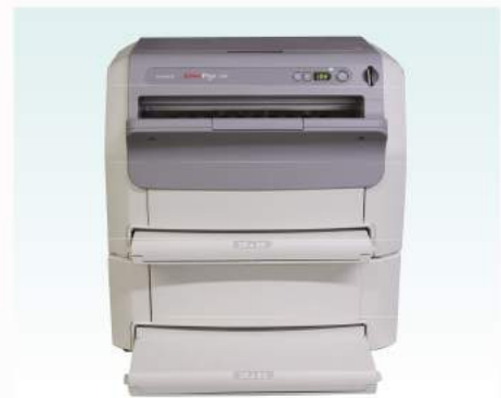
DRYPIX Lite shown optional sheet feeder unit and 2magazines

Specifications are subject to change without notice. All brand names or trademarks are the property of their respective owners. In some countries, regulatory approval may be required to import medical devices. For the availability of these products, please contact your local sales representatives.